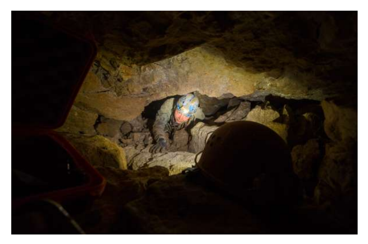
The Chutney Mines – an awkward crawl 700 metres down that had to be dug out and capped.