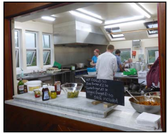
Les at the bar