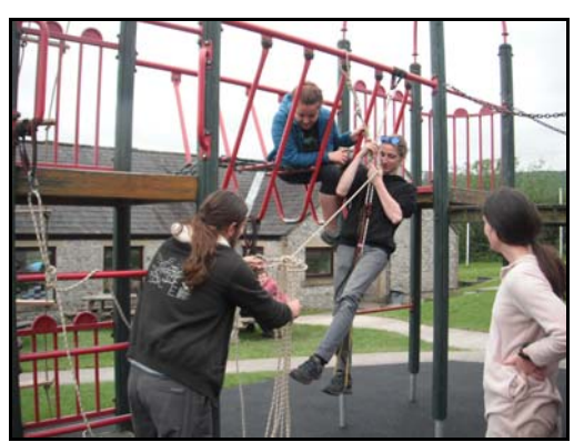
Children at play on the climbing frame