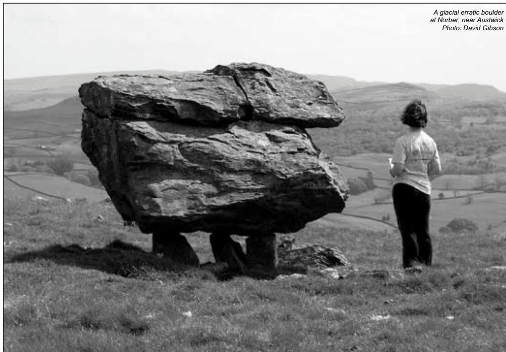
A glacial erratic boulder at Norber, near Austwick

Apologies if this notice arrives after the date of the field meeting, which was advertised on the BCRA web site and in Descent magazine. Due to the decision to cease publication of paper newsletters, wider coverage was not possible in the time-frame available.