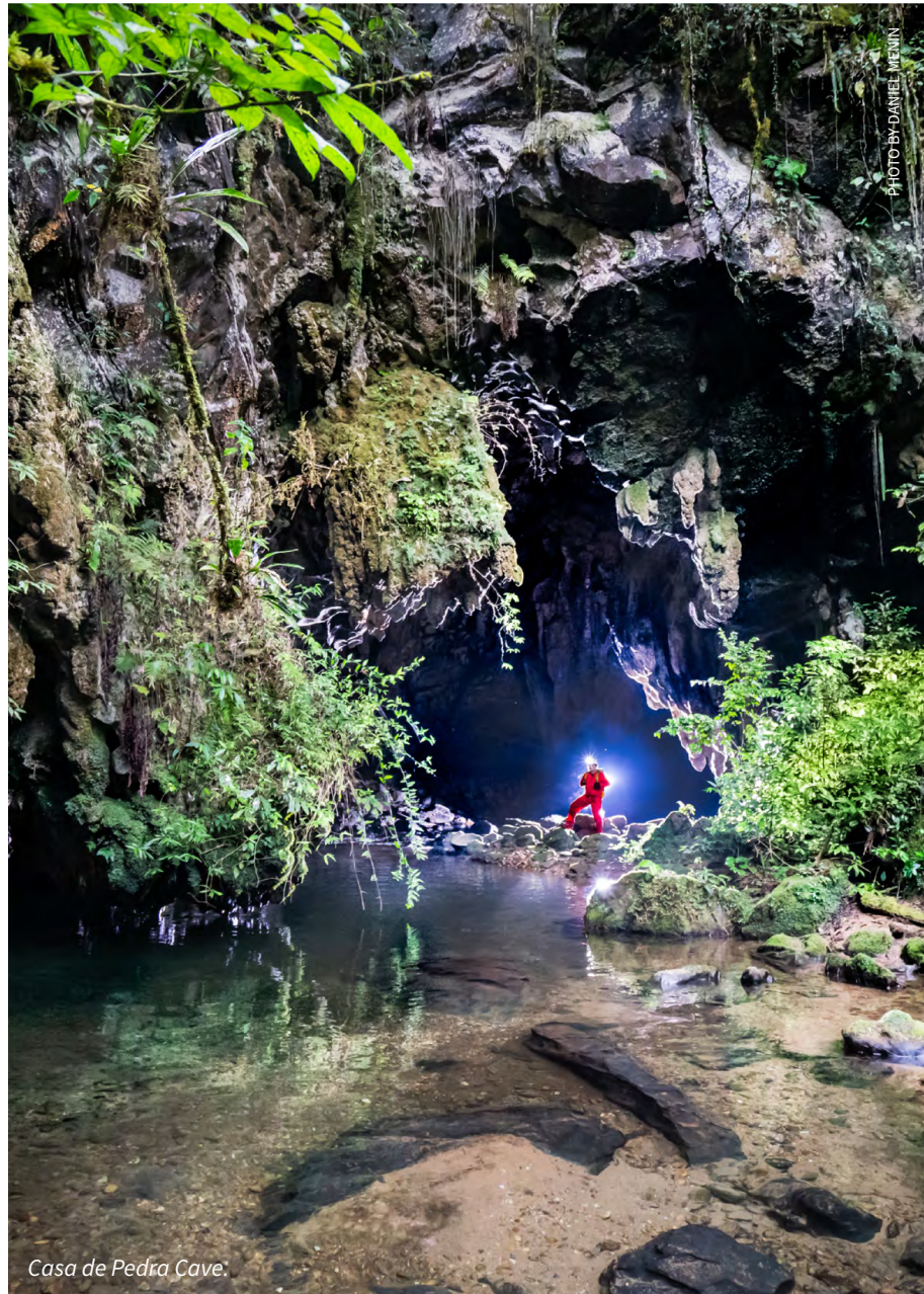
Casa de Pedra Cave.