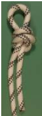
Barrel Knot Figure C.1

The name Barrel Knot was given in an English publication 14 in 2001, see Figure C.1, to the knot shown on page 8, see Figure C.2. The description of a Barrel Knot 15 however, is one which applies to a number of turns, perhaps as many as 8 and is used to join two lengths of line, see Figure C.3. Variations in usage of the Barrel Knot within a Cow's Tail in the United Kingdom include using three turns. This translation adopts the convention of using the term "Barrel Knot" in place of the French name "Half a Double Fisherman's Knot" [Demi pêcheur double].